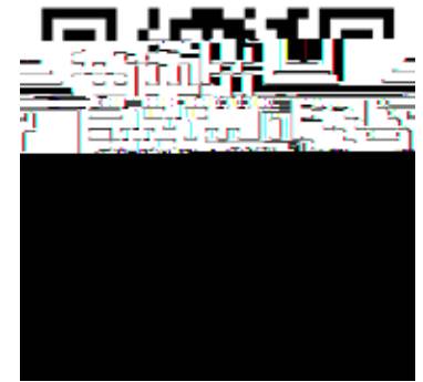
(Donate via this QR Code)

Race Equality Matters provide many solutions resources and events for free, so: 1. Everyone can access them, regardless of budget. 2. The real barriers to race equality in the workplace are addressed. 3. The change we all want to see and feel, is accelerated.